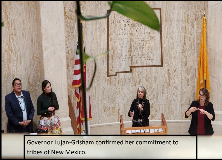
Governor Lujan-Grisham confirmed her commitment to tribes of New Mexico.